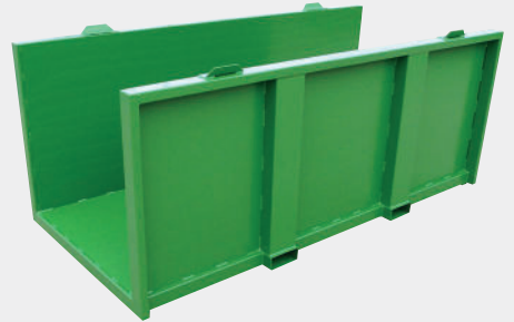
Custom open-ended skip