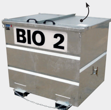
Galvanized version with lid