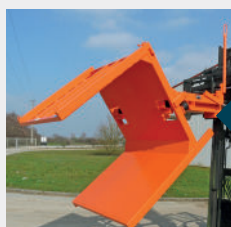
Customised version with sheet metal