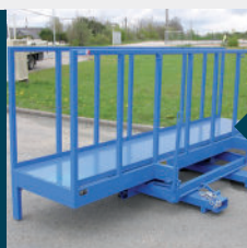
version large length