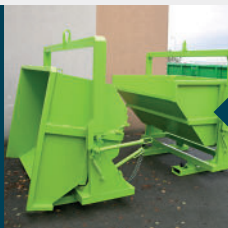
Adjustable hinged handle