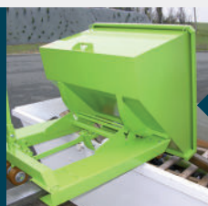
Automatic release on contact