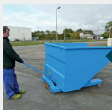
Castor-mounted model with drawbar