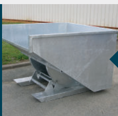
Galvanized pedestal-mounted model