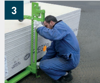
Adjustable retaining arms fitted