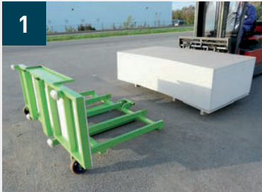
Boards are loaded onto the trolley