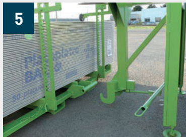
Handling trolley gripped by the spreader - Lever is unclipped by automatic locking of the hook onto the handling trolley with no intervention from the forklift driver