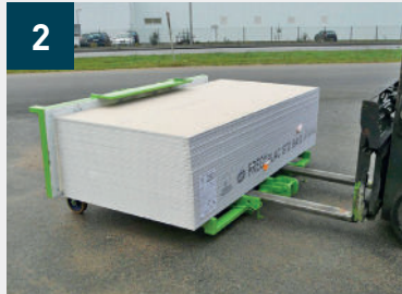
Stack placed on trolley