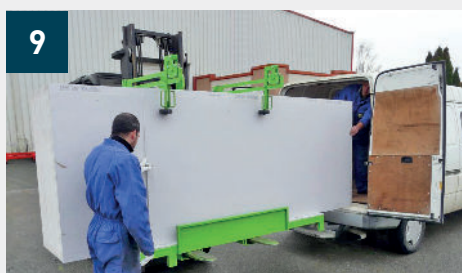
Easy loading by just sliding the boards to the right - After loading, the adjustment arms need to be repositioned to hold the remaining boards