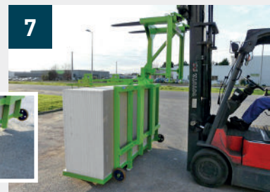
Trolley in unloading position before removal of the PK spreader