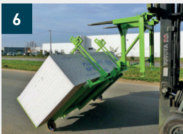
Trolley tilted vertically, the 4 high-density polyethylene feet prevent the ground from being marked