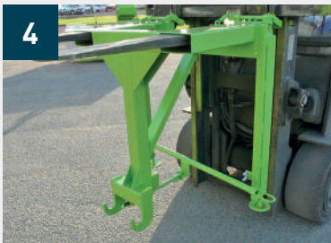
PK spreader put on forklift truck