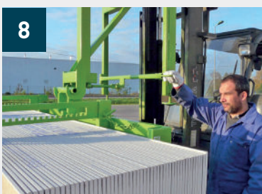
Lever clipped on to enable the spreader to be unhooked and removed