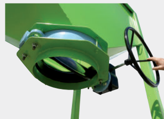
Handwheel butterfly valve