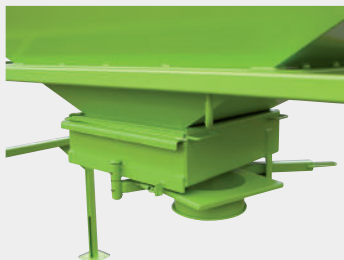
Articulated rotating hatch