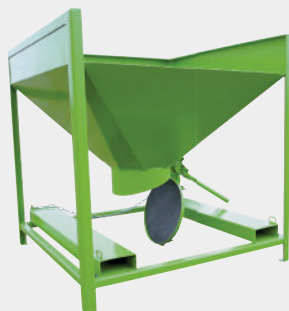
Round chute, sealed by eccentric lever