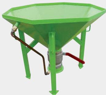
Spherical ball valve