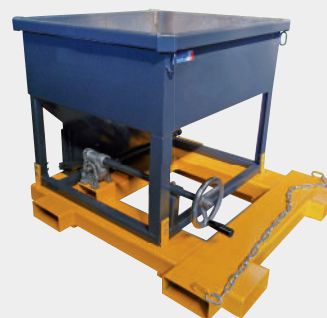
Flow adjustment sliding hatch with reduction gearing and angle gearing