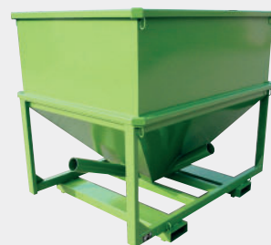
Hopper with breathing pipes