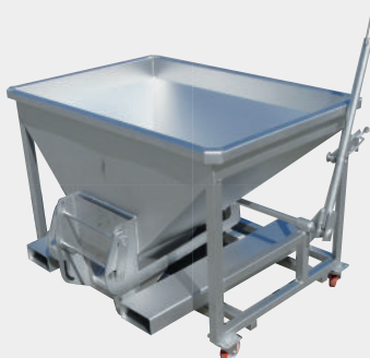
Sealed sliding hatch