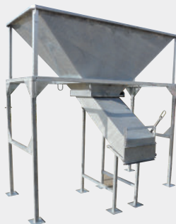
Sliding hatch and special downspout