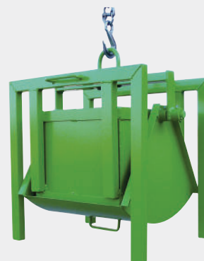
Crane grip helmet hopper