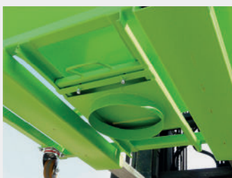
Basic sliding hatch for light products