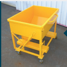
Castor-mounted 500 L model