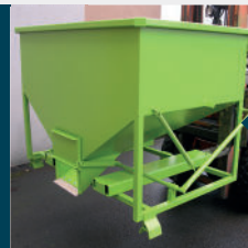
Lever locked, gate open