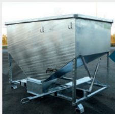
Optional front lever