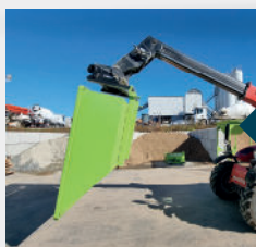
Dump position by tilting the forks