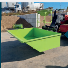
Working height 500 mm